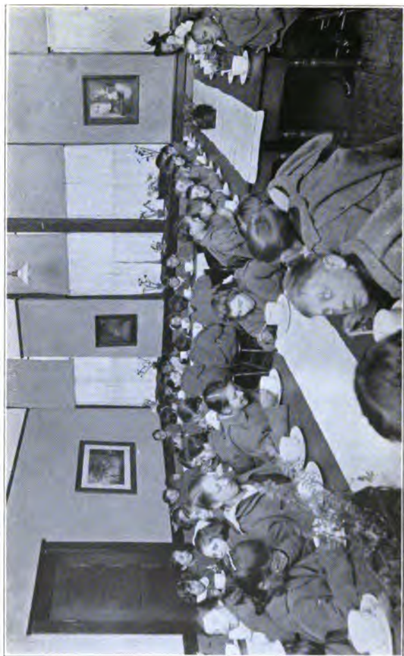
Open air lunch at the Eagle School